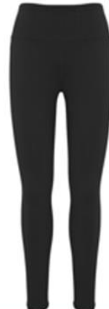
Ladies Full Flex Leggings