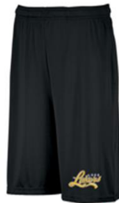
Russell Essential Pocketed Short