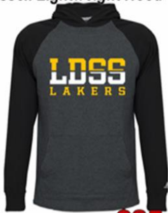
Russell Lightweight Hood