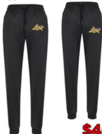
Jogger Pants (Mens/Ladies)